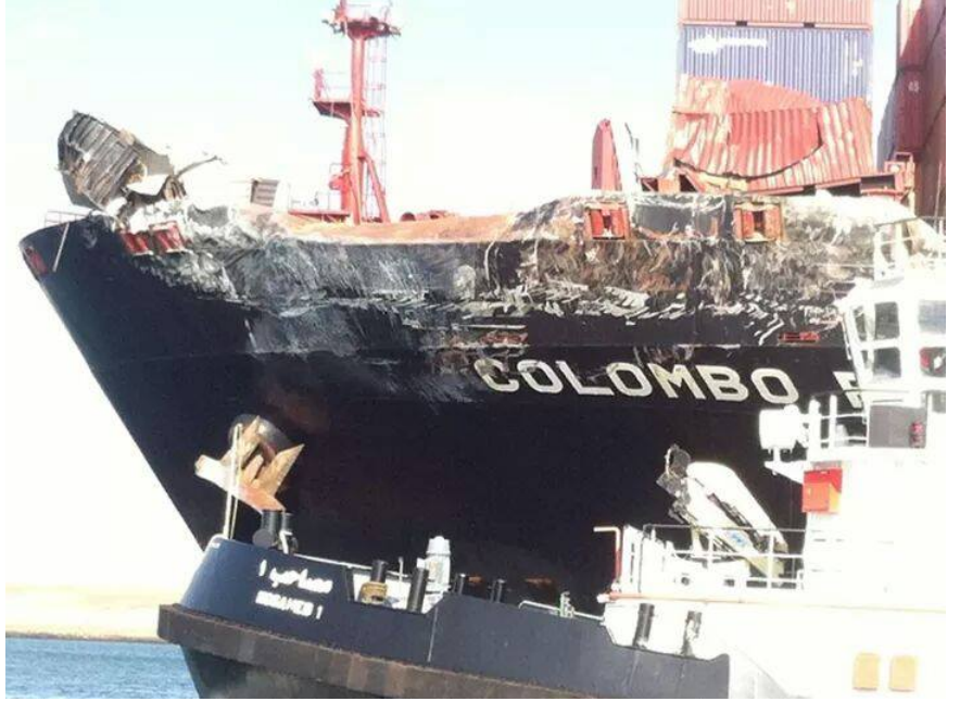
Colombo Express Damage

The Real Story Behind Youtube's Most Epic Ship Collision Video - gCaptain