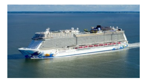
Passengers Injured as Norwegian Escape Hit by '100 Knot Wind Gust' Off U.S. East Coast