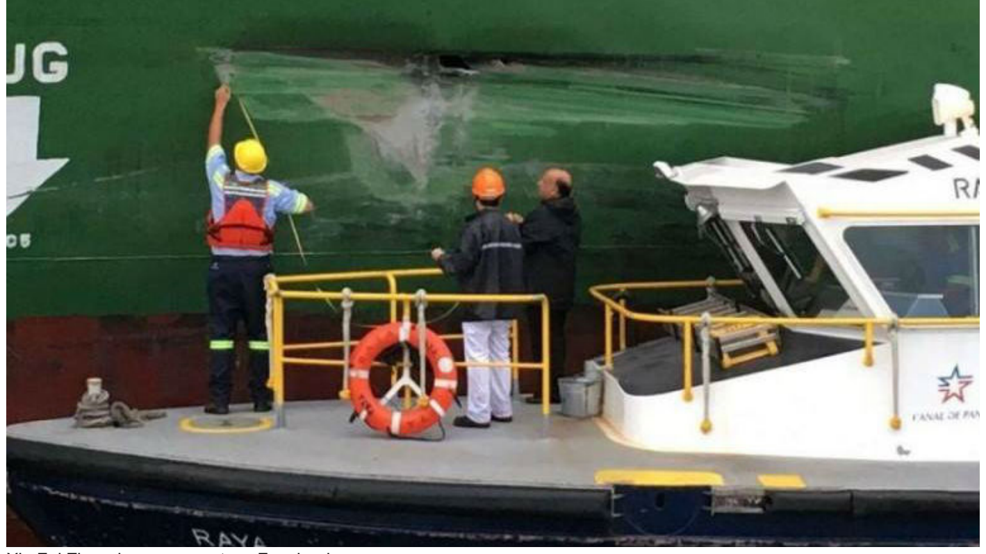
Xin Fei Zhou damage, courtesy Facebook.