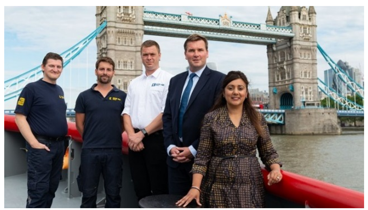
(https://www.maritime-executive.com/corporate/u-k-s-maritime-minister-visits-kotug-smit-s-hybrid-tug) U.K.'s Maritime Minister Visits Kotug Smit's Hybrid Tug (https://www.maritime-executive.com/corporate/u-k-s-maritime-minister-visits-kotug-smit-s-hybrid-tug) By The Maritime Executive (https://www.maritime-executive.com/author/marex)