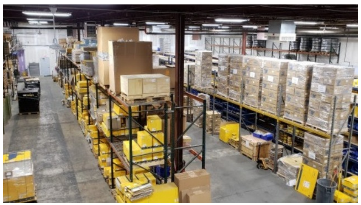
(https://www.maritime-executive.com/corporate/vetus-maxwell-expands-its-maryland-headquarters) VETUS MAXWELL Expands its Maryland Headquarters (https://www.maritime-executive.com/corporate/vetus-maxwell-expands-its-maryland-headquarters) By The Maritime Executive (https://www.maritime-executive.com/author/marex)

(https://www.maritime-executive.com/corporate/green-marine-needs-your-vote-for-safety4sea-awards) Green Marine Needs Your Vote for Safety4Sea Awards (https://www.maritime-executive.com/corporate/green-marine-needs-your-vote-for-safety4sea-awards) By The Maritime Executive (https://www.maritime-executive.com/author/marex)