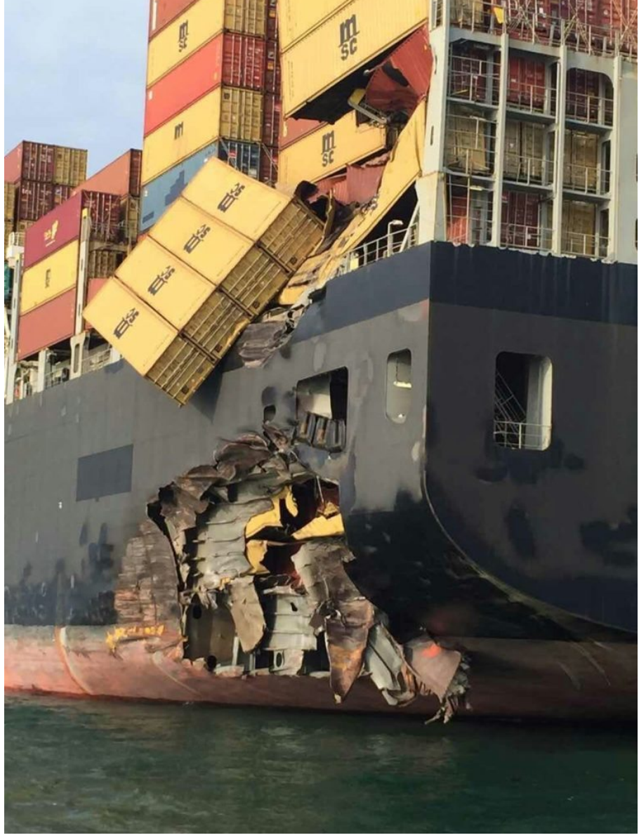
Damage to the MSC Alexandria.

Iranian Supertanker Collides With Giant MSC Boxship in Singapore Strait - Incident Photos - gCaptain