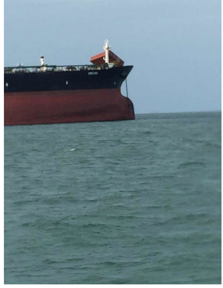
Fallen containers on the deck of the Dream II VLCC.