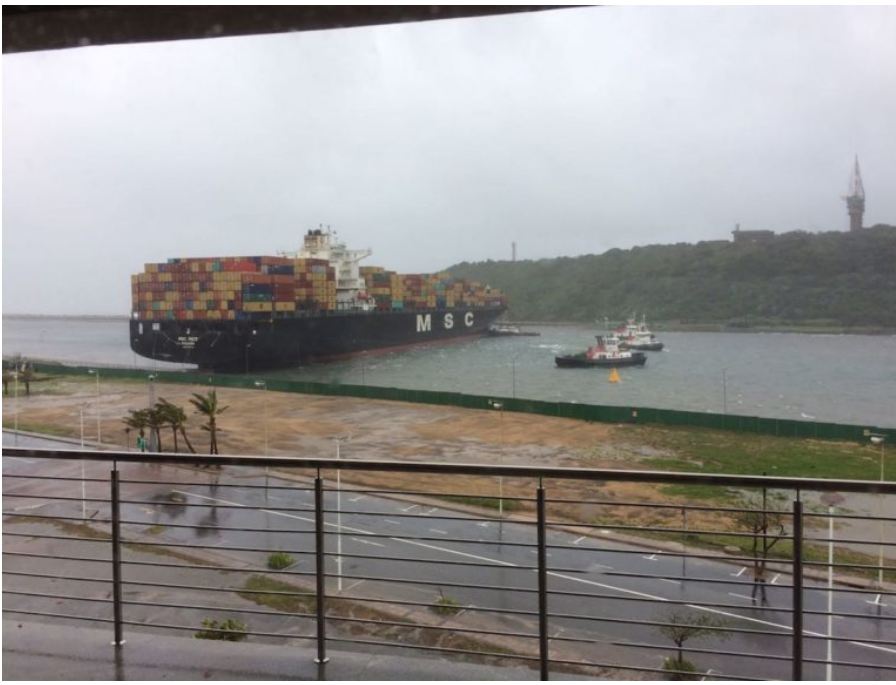
As of 6 p.m. local time it was unclear if tugs were able to retrieve the vessel. AlS data as of 5 p.m. local time (screenshot below) showed the ship still in the channel with its status as 'moored'. In the screenshot below from MarineTraffic.com, you can see the track the MSC Ines took across the harbour.