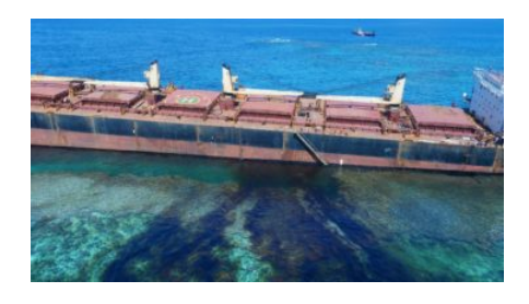
Grounded Bulk Carrier Leaking Heavy Fuel Oil Near UNESCO World Heritage Site