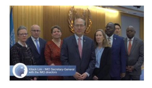
VIDEO: An Important Message From IMO Secretary-General Kitack Lim