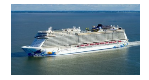
Passengers Injured as Norwegian Escape Hit by '100 Knot Wind Gust' Off U.S. East Coast