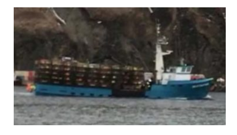
U.S. Coast Guard Issues Findings of Concern from FV Destination Investigation