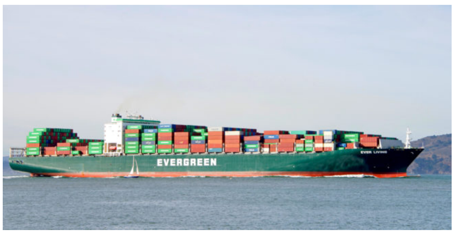
② 10 days ago ■ News

In Hamburg, it came on Saturday (Feb. 9) morning on the Elbe to a ship collision. The 400-meter-long freighter "Ever Given" drove against a HADAG ferry, which lay at the pier Blankenese.