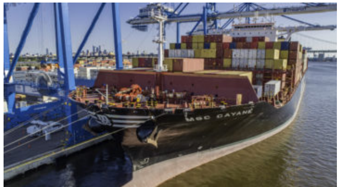
U.S. Authorities Seize MSC Gayane After Record Drug Bust