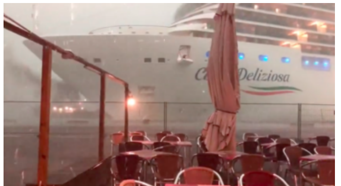
Watch: Large Cruise Ship Close Call in Venice Canal - Updated with AIS