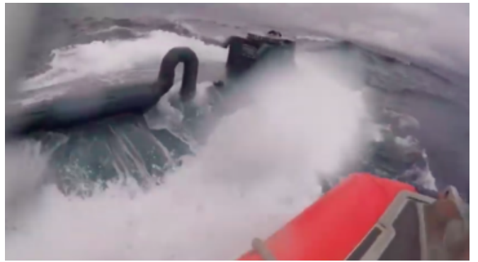
Watch: U.S. Coast Guard Crew Chases Down Narco Sub in the Pacific