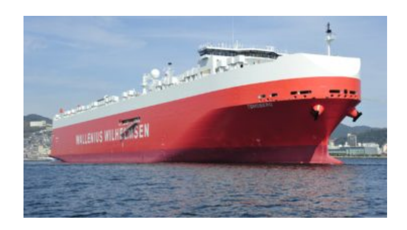
Wallenius Wilhelmsen Announces 2,500 Temporary Layoffs in U.S. and Mexico