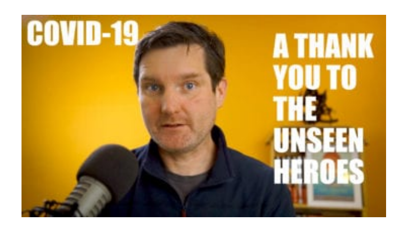
VIDEO: THANK YOU To The Unseen Maritime Professionals On The Front Lines Of COVID-19