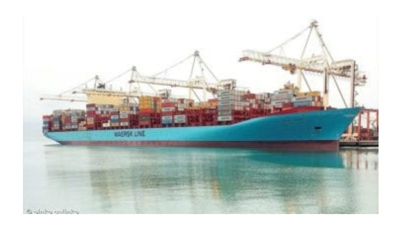
Seafarers on Maersk Ship Test Positive for COVID-19 in China