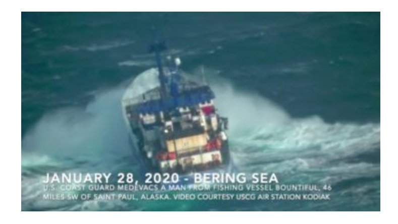
Watch: Heavy Seas Medevac in Bering Sea