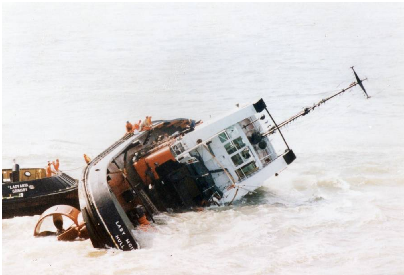
lady moira laid over