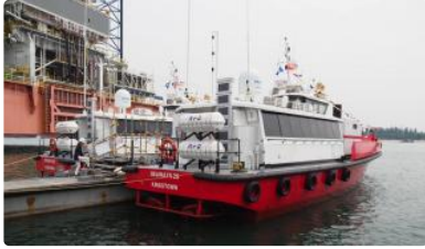
Seaways International takes delivery of two Damen FCS 2206