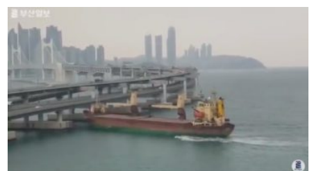
New Video Shows Russian Cargo Ship's Busan Mayhem