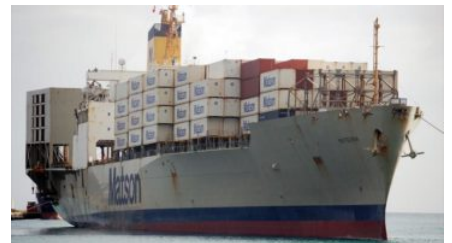
Hull Cracks & Oil Spills From El Faro's 46 Year Old Sister Ship