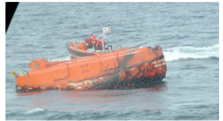
Today Marks 15 Years Since the Explosion and Sinking of the Bow Mariner, One of the Worst Chemical Tanker Disasters in History

Both vessels have since been allowed to return to service.