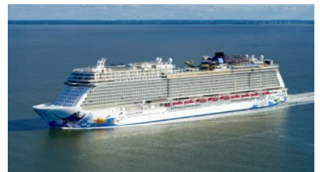
Passengers Injured as Norwegian Escape Hit by '100 Knot Wind Gust' Off U.S. East Coast