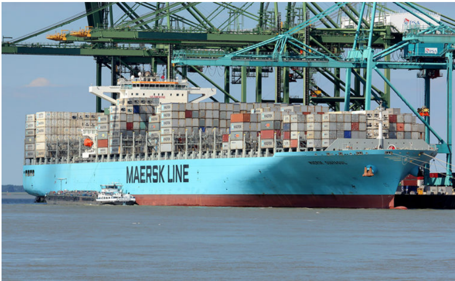
Maersk Genoa's sister vessel.

A large Maersk containership was involved in a collision with a much smaller freighter in the Western Scheldt in in southwestern Netherlands on Tuesday, causing damage to both vessels.