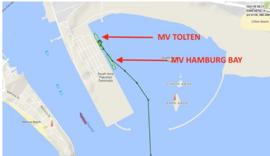
The path of the MV TOLTEN is seen in green.

All shipping operations at the port has been suspended as officials assess cleanup of the lost containers.