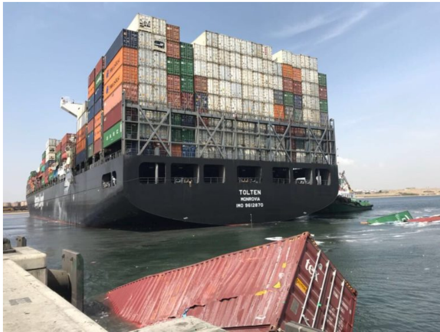
The MV TOLTEN following its collision with the MV HAMBURG BAY at the Port of Karachi.