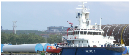
Tragic accident on ENI rig and supply ship, 1 died 2 injured, Italy