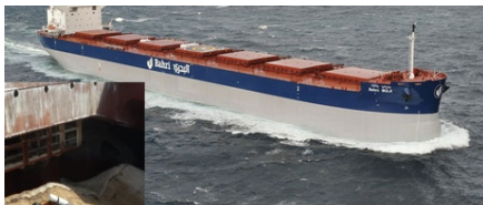
Master, Chief Officer and AB died in tragic accident on board of UAE bulk carrier