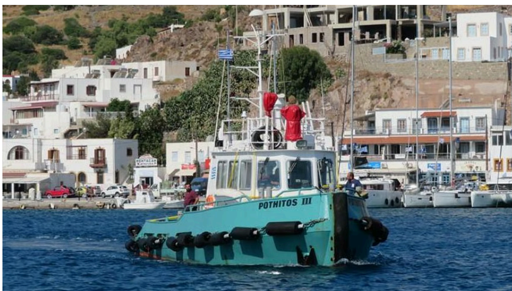
Pothitos III