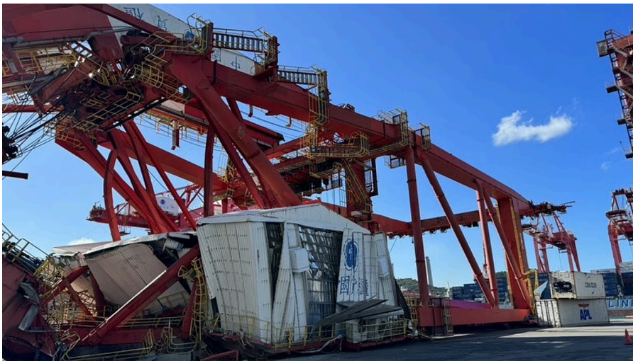
The collapsed gantry crane Keelung Harbour Police