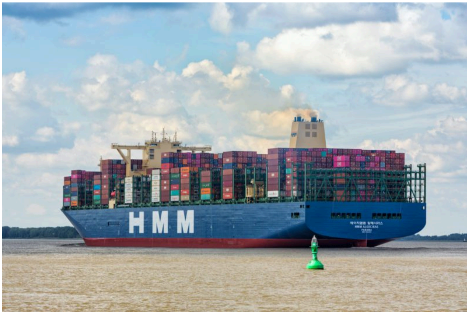
HMM St. Petersburg's sister ship, HMM Algeciras.

The HMM St. Petersburg operates on the FE4 service route between North China and North Europe. The containership, delivered in 2020 as the final vessel in a series of 12 sister ships for South Korea's HMM, spans nearly 400 meters in length with a capacity of 24,000 TEUs, making it one of the world's largest containerships.