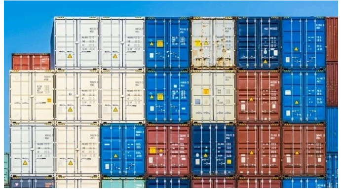
( https://maritime-executive.com/article/azerbaijan-socar-container-terminal-in-turkey-not-for-sale ) Azerbaijan SOCAR Container Terminal in Turkey Not for Sale ( https://maritime-executive.com/article/azerbaijan-socar-container-terminal-in-turkey-not-for-sale )