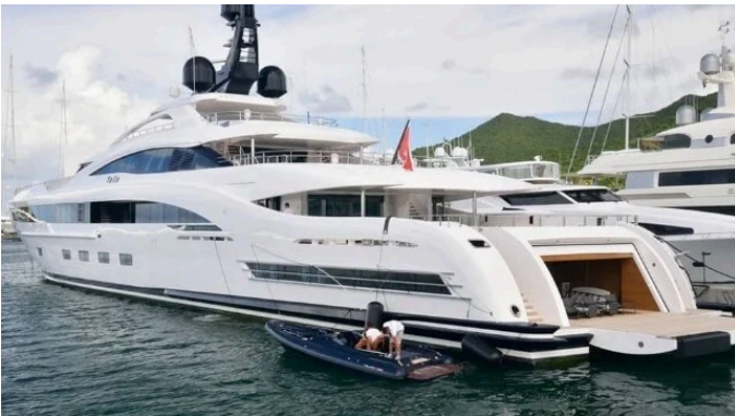
( https://maritime-executive.com/editorials/op-ed-yacht-industry-needs-serious-reform-to-ensure-crew-safety ) Op-Ed: Yacht Industry Needs Serious Reform to Ensure Crew Safety ( https://maritime-executive.com/editorials/op-ed-yacht-industry-needs-serious-reform-to-ensure-crew-safety )