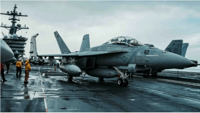
( https://maritime-executive.com/article/u-s-navy-releases-identity-of-us-navy-releases-identity-of-carrier-crewmember-missing-in-timor-sea ) US Navy Releases Identity of Carrier Crewmember Missing in Timor Sea ( https://maritime-executive.com/article/u-s-navy-releases-identity-of-carrier-crewmember-missing-in-timor-sea )