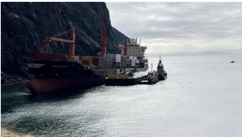
Salvage teams were able to position a barge alongside as the weather improved in the area

PUBLISHED MAR 21, 2025 5:00 PM BY THE MARITIME EXECUTIVE ( HTTPS://MARITIME-EXECUTIVE.COM/AUTHOR/MAREX )