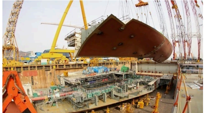
( https://maritime-executive.com/article/south-korea-gets-ready-to-roll-out-masga-shipbuilding-investments ) South Korea Gets Ready to Roll Out "MASGA" Shipbuilding Investments ( https://maritime-executive.com/article/south-korea-gets-ready-to-roll-out-masga-shipbuilding-investments )