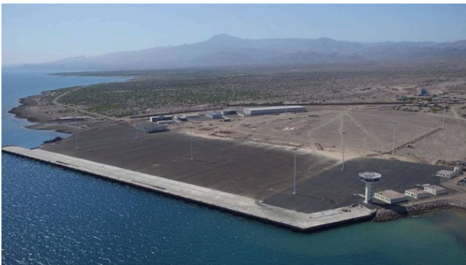
( https://www.maritime-executive.com/article/saudi-s-rsgt-finalizes-30-year-lease-of-djibouti-s-tadjourah-port ) Saudi RSGT Finalizes 30-Year Lease of Djibouti's Tadjourah Port ( https://www.maritime-executive.com/article/saudi-s-rsgt-finalizes-30-year-lease-of-djibouti-s-tadjourah-port )