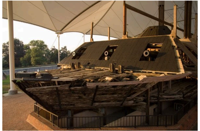
( https://www.maritime-executive.com/article/historic-u-s-civil-war-ship-decaying-due-to-fungal-invasion ) Historic U.S. Civil War Ship Decaying Due to Fungal Invasion ( https://www.maritime-executive.com/article/historic-u-s-civil-war-ship-decaying-due-to-fungal-invasion )