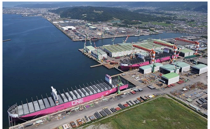
( https://www.maritime-executive.com/article/report-japan-and-u-s-to-sign-memorandum-on-shipbuilding-cooperation ) Report: Japan and U.S. to Sign Memorandum on Shipbuilding Cooperation ( https://www.maritime-executive.com/article/report-japan-and-u-s-to-sign-memorandum-on-shipbuilding-cooperation )