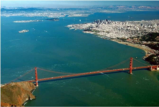
( https://www.maritime-executive.com/article/ngos-sues-to-protect-whales-from-ships-docking-in-california-s-ports ) NGOs Sue to Protect Whales from Ships Docking in California's Ports ( https://www.maritime-executive.com/article/ngos-sues-to-protect-whales-from-ships-docking-in-california-s-ports )