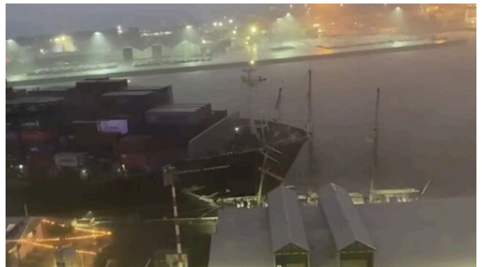
( https://www.maritime-executive.com/article/poor-bridge-resource-management-led-to-boxship-hitting-tall-ship ) Poor Bridge Resource Management Led to Boxship Hitting Tall Ship ( https://www.maritime-executive.com/article/poor-bridge-resource-management-led-to-boxship-hitting-tall-ship )