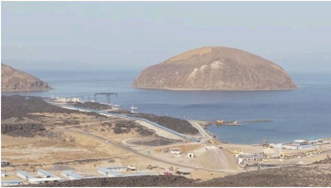
( https://www.maritime-executive.com/article/saudi-s-rsgt-finalizes-30-year-lease-of-djibouti-s-tadjourah-port ) Saudi's RSGT Finalizes 30-Year Lease of Djibouti's Tadjourah Port ( https://www.maritime-executive.com/article/saudi-s-rsgt-finalizes-30-year-lease-of-djibouti-s-tadjourah-port-2 )