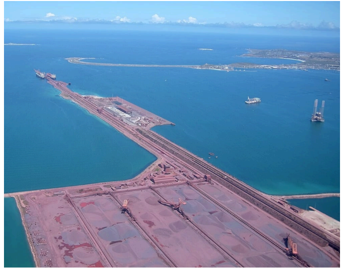
( https://www.maritime-executive.com/article/study-south-africa-europe-shipping-route-could-run-on-ammonia-by-2029 ) Study: South Africa-Europe Shipping Route Could Run on Ammonia by 2029 ( https://www.maritime-executive.com/article/study-south-africa-europe-shipping-route-could-run-on-ammonia-by-2029 )