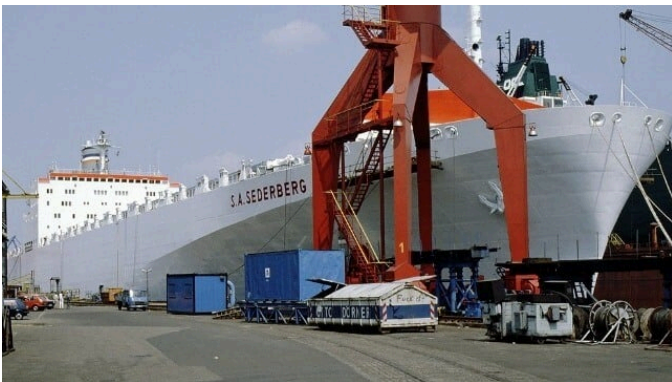
( https://www.maritime-executive.com/article/south-africa-halts-plans-for-establishing-a-shipping-line ) South Africa Halts Plans for Establishing a Shipping Line ( https://www.maritime-executive.com/article/south-africa-halts-plans-for-establishing-a-shipping-line )